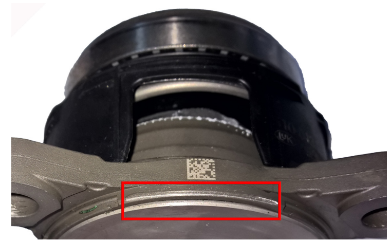
Fig. 2: Damaged concentric slave cylinder with separated gasket