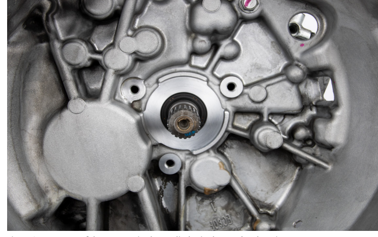
Fig. 1: Contact area of the concentric slave cylinder in the gearbox housing